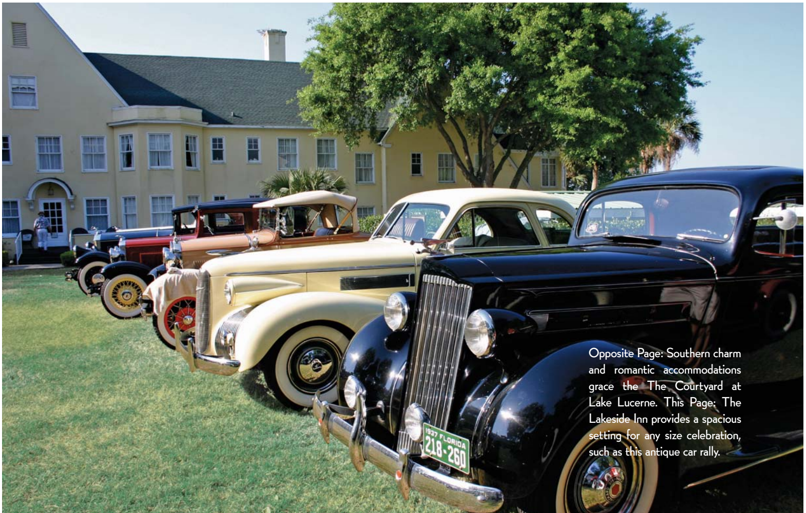
Opposite Page: Southern charm and romantic accommodations grace the The Courtyard at Lake Lucerne. This Page: The Lakeside Inn provides a spacious setting for any size celebration, such as this antique car rally.

The Albin Polasek Foundation was founded in 1961 by internationally acclaimed sculptor Albin Polasek and his wife. This scenic property is different from traditional Florida estates and features an “uncomplicated” yet romantic aesthetic. Nestled on Lake Osceola, Polasek is surrounded by three acres of green velvet lawns and pathways blooming with lilies and other exotic flora, as well as dozens of lyrical and classical sculptures by the artist.