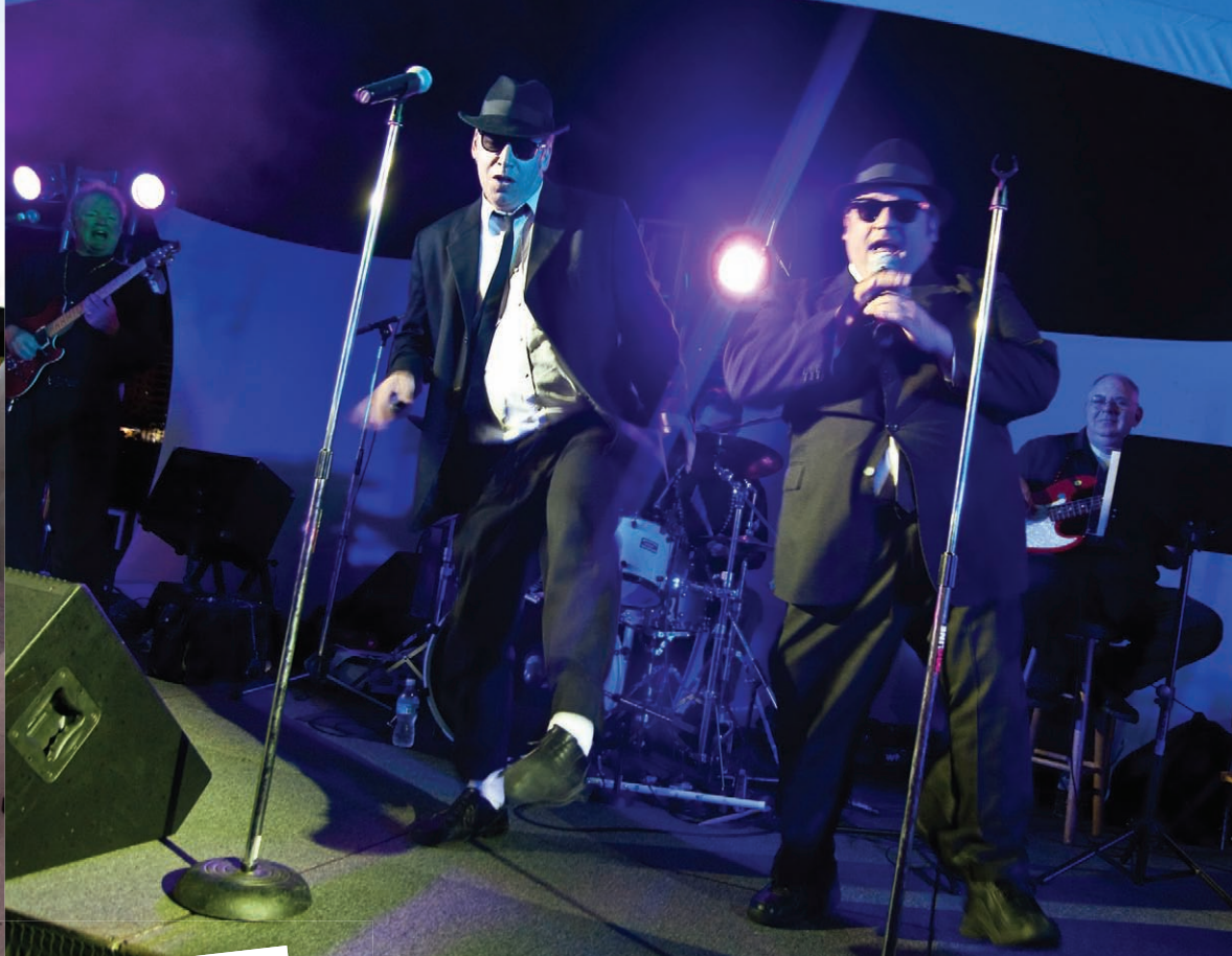
Street entertainers and Blues Brothers provided fun and music.